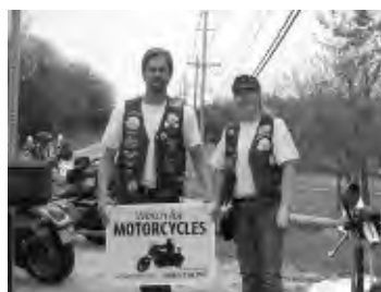
Local 24 President & First Mouse placing signs