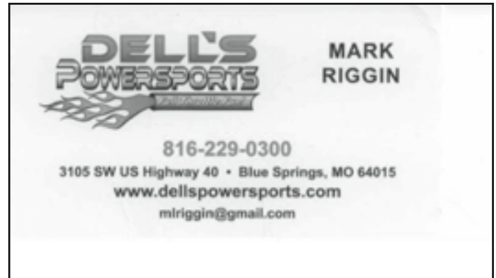
Corporate Sponsor - September 2017 / August 2018